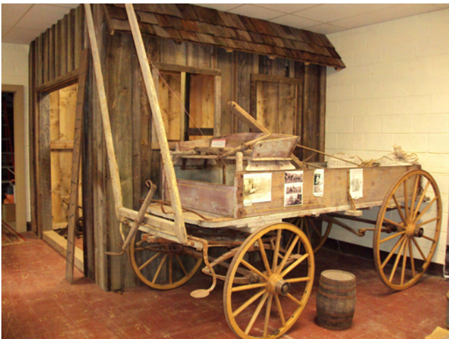
Recreated Blacksmith Shop at the Museum