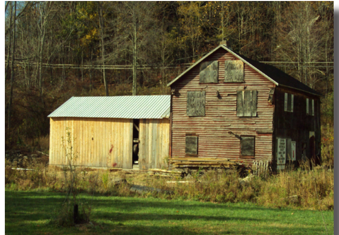
The Yarns Cider Mill at the Suraci Farm

Grant funds from the Endless Mountains Heritage Region, Inc., matched by incredible donations of local time, materials and money will make these goals a reality. In 2015, we will tackle the challenge of preparing the original pressing equipment to operate once more.